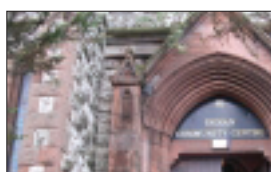
The Indian Community Centre in Belfast