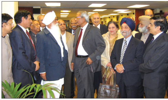
The High Commissioner interacting with members of the Indian community at the Consulate.